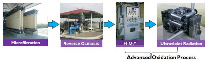
Figure 3—Treatment Processes at the Expanded Leo J. Vander Lans Advanced Water Treatment Facility

recycled municipal wastewater that has undergone advanced treatment are injected at the Barriers. Figure 3 illustrates the advanced treatment processes provided at the Leo J. Vander Lans Advanced Water Treatment Facility, consisting of: microfiltration, reverse osmosis, and advanced oxidation process (hydrogen peroxide addition to be completed in 2014). The recycled water from the facility is injected at the Alamitos Gap Barrier.