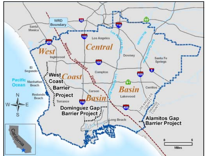
Figure 2—Location of Seawater Barrier Projects

the fresh water aquifers in the CBWCB for nearly 60 years. The locations of these projects are shown in Figure 2 . Currently, both imported potable water and