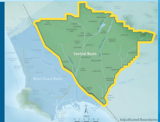
The Water Replenishment District's service area in southern Los Angeles County

WRD manages and protects two of the most utilized urban groundwater basins in the nation. Groundwater from these basins provides nearly 50% of the total water supply for the four million residents in WRD's 43-city service area which covers 420 square miles in southern Los Angeles County. WRD ensures that a reliable and locally sustainable supply of high-quality groundwater is available through replenishment with recycled water and stormwater capture.