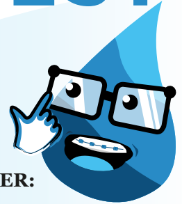
WRD Water Nerd