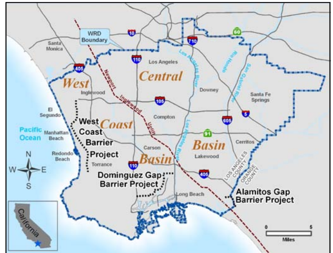
Figure 2—Location of Seawater Barrier Projects

the fresh water aquifers in the CBWCB for nearly 60 years. The locations of these projects are shown in Figure 2 . Currently, both imported potable water and