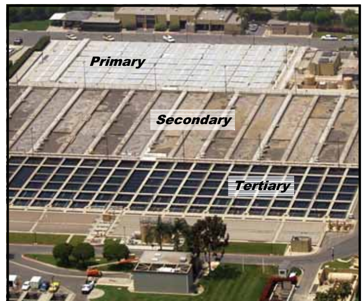
Figure 1: Wastewater Treatment at the LA County Sanitation Districts' San Jose Creek East Plant. The finished tertiary water is used for groundwater recharge in the Montebello Forebay.

Secondary Treatment: The purpose of this stage is to remove most of the dissolved and suspended organic material from the wastewater. Aeration tanks bubble air