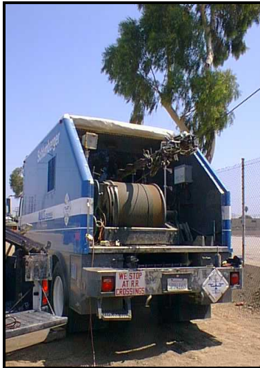
Figure 1 Borehole logging truck with wireline and drawworks.

Spontaneous Potential (SP) is a measure of the electrochemical voltage difference between the formation