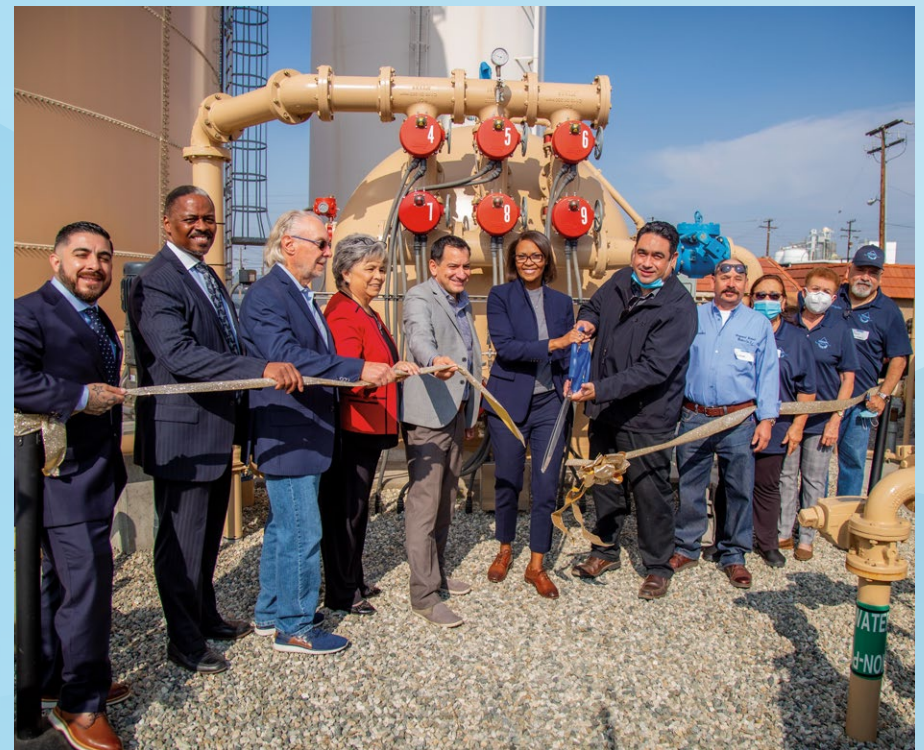
WRD and project partners celebrate the ribbon cutting for the Maywood Mutual Water Company No. 2 well system remediation project.

As such, the WRD Disadvantaged Communities (DAC) Assistance Program has helped over a dozen small water providers to secure over $20 million in grants and low-cost loans.