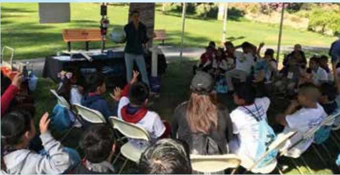
WRD participates at Orange County Water District's Annual Water Festival.