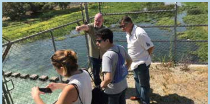
Water Education for Latino leaders (WELL) guests learned about WRD's groundwater management practices in the San Gabriel Spreading Grounds.