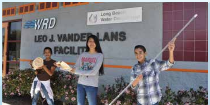
North Park Middle School visited Leo J. Vander Lans Advanced Water Treatment Facility & the Long Beach Water Reclamation Plant to learn about water treatment processes.