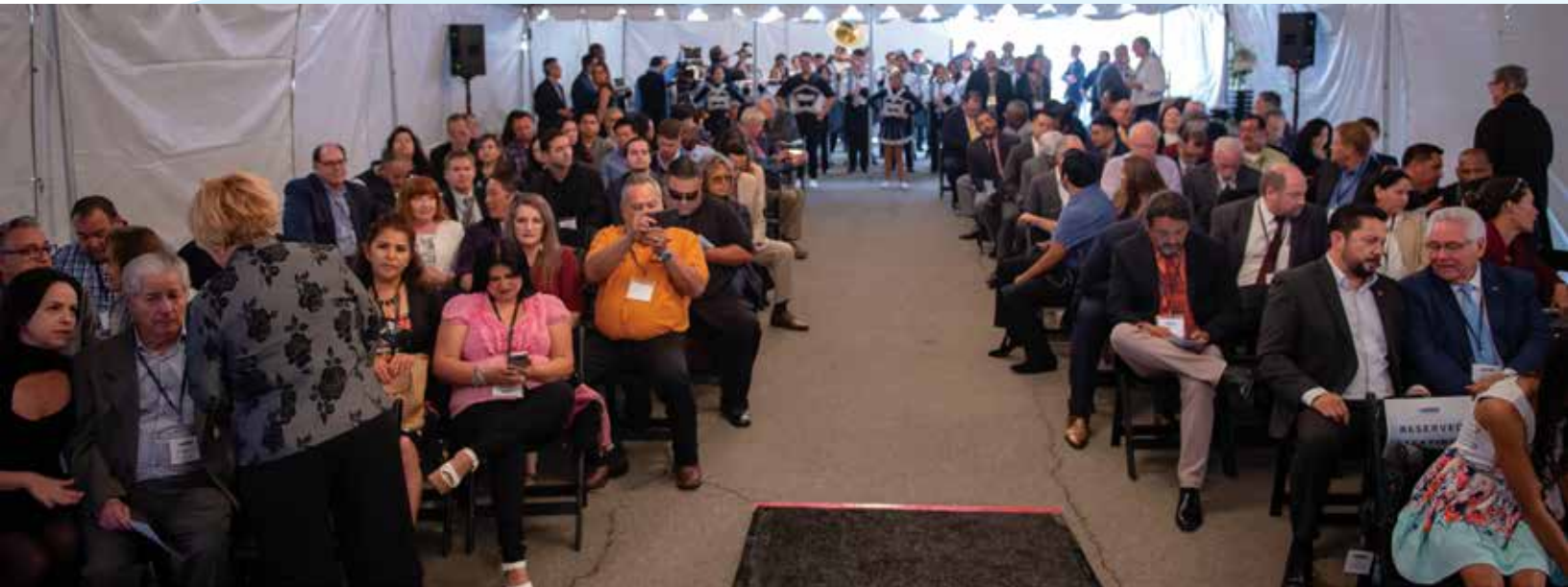
Naming Ceremony for GRIP

The Water Replenishment District of Southern California is counting down the days to fulfilling its mission to make the region completely independent from imported water for groundwater replenishment.