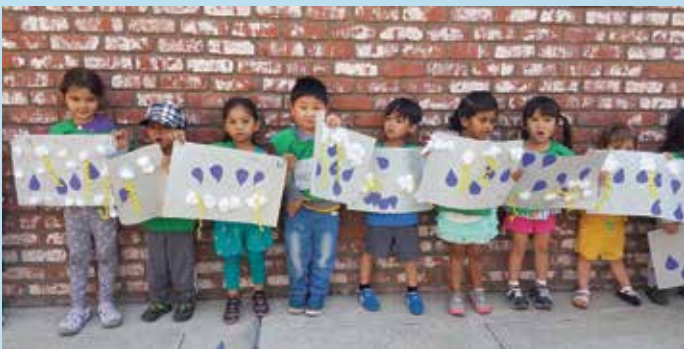
Teaching the value of rain & drinking water at Los Cerritos Park East Tot Lot.