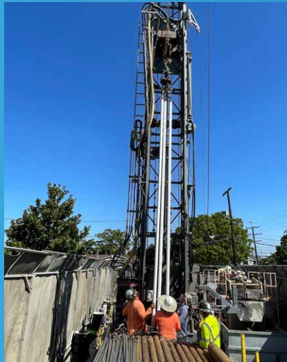
This monitoring well, located at La Romeria Park in Torrance helps WRD's hydrogeologist track the levels of groundwater in aquifers.

WRD recently completed the construction of nested monitoring well PM-9 as part of its water quality characterization efforts for the Brackish Groundwater Reclamation Program in Torrance, CA.