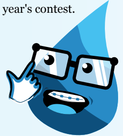
WRD Water Nerd