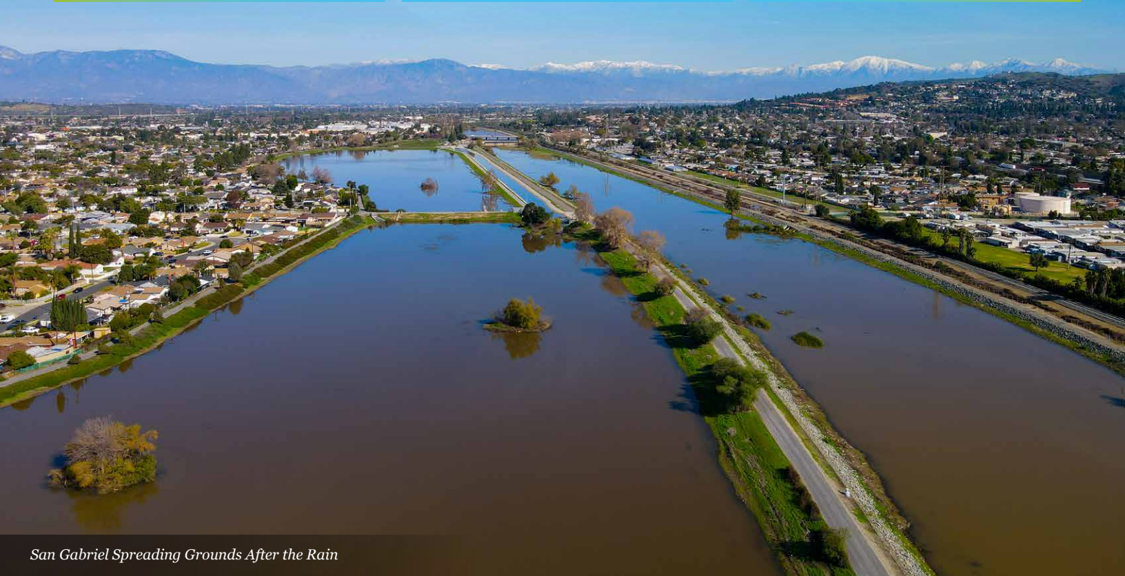
San Gabriel Spreading Grounds After the Rain