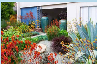
SUSTAINABLE LANDSCAPE DESIGN

WRD offers free gardening classes both in-person and online. Discover the tips and tricks to greener and more sustainable gardening at one of WRD's free Eco Gardening classes. Sign up today!