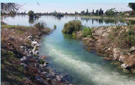
Los Angeles County San Gabriel Spreading Grounds - Full

As California celebrates this remarkable year for replenishment, WRD remains committed to ensuring the long-term water security of its communities. The dedication and collaboration of WRD and its partners exemplify the spirit of resilience that defines the region.