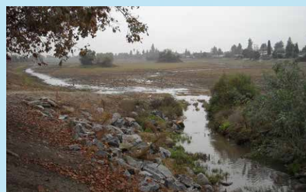
Los Angeles County San Gabriel Spreading Grounds - Empty