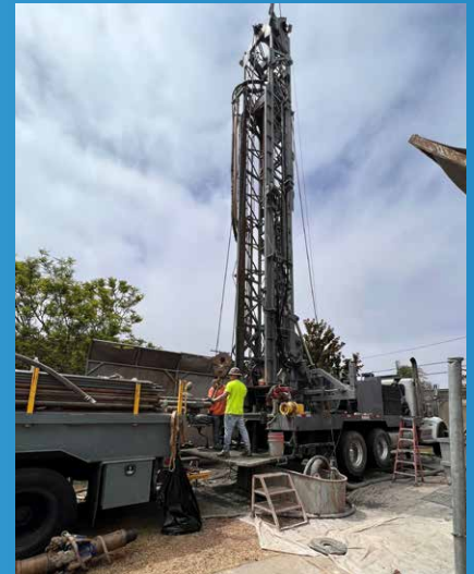
A drill rig is used to install the well at 800 feet below the surface.