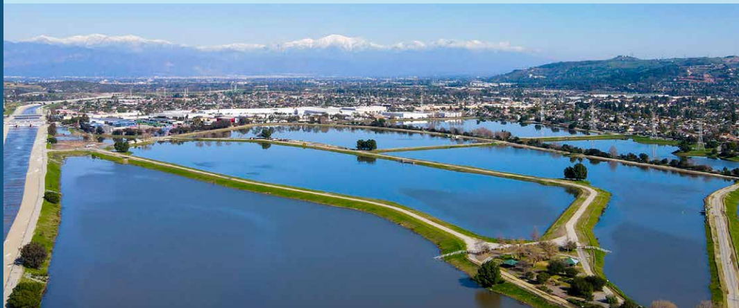
Aerial view of the Rio Hondo Spreading Grounds in Pico Rivera, CA