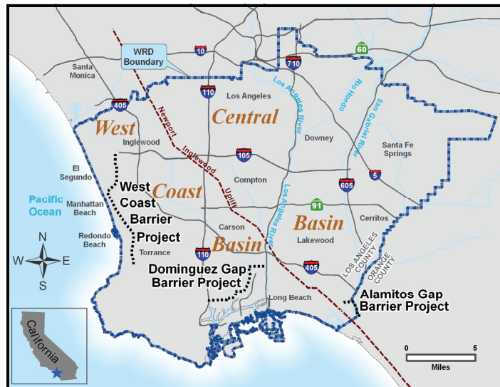
Figure 2 - Location of Seawater Barrier Projects

Based on the success of the tests, the LACFCD eventually constructed the West Coast Basin Barrier Project, the Dominguez Gap Barrier Project, and the Alamitos Gap Barrier Project. The locations of these projects are shown on Figure 2 . The barrier wells inject water into the aquifers to build up a line of pressure equal to or exceeding the protective elevations predicted by the Ghyben-Herzberg principal, blocking the intrusion.